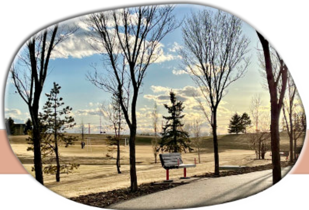
SUBJECT Valleyview Park